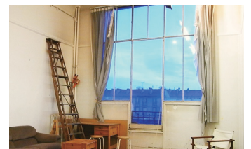
Nichido atelier in Paris